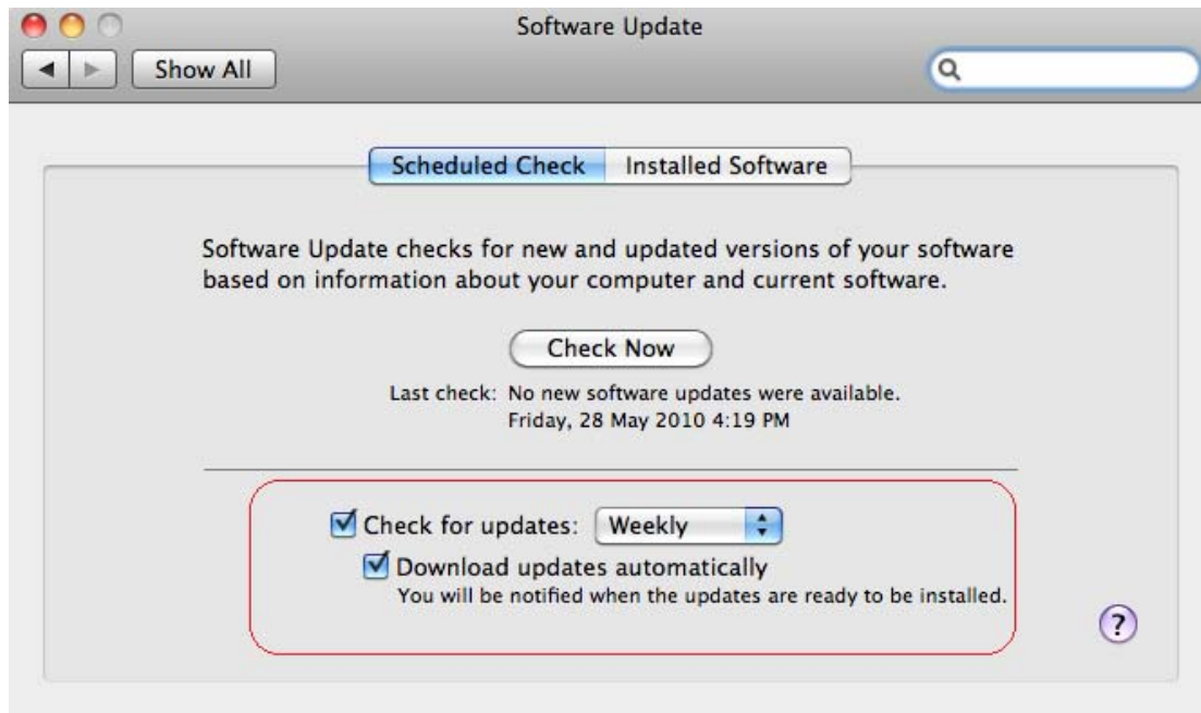
Figure 3, Mac OS X, Software Update pane